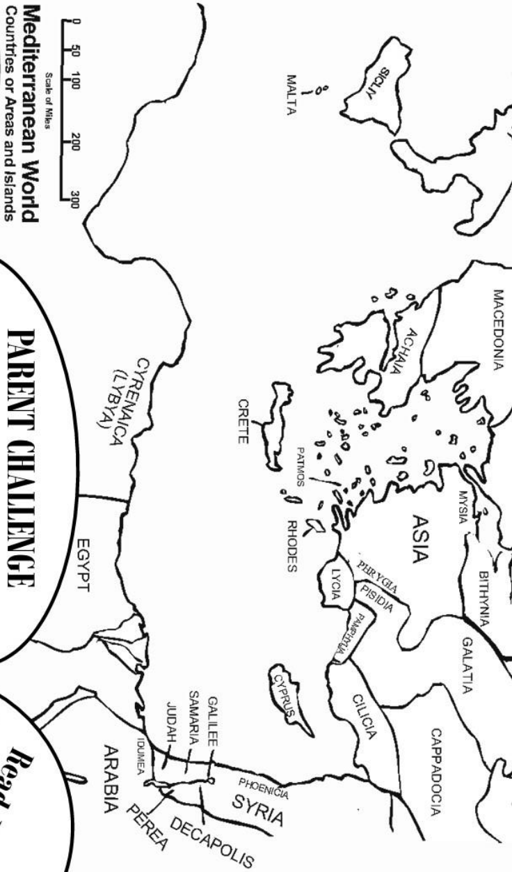
Mediterranean World Countries or Areas and Islands